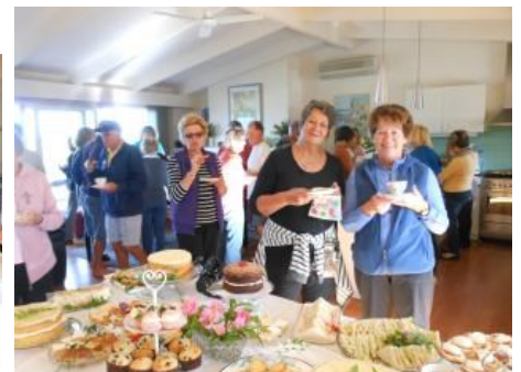
Fun with fundraising morning tea