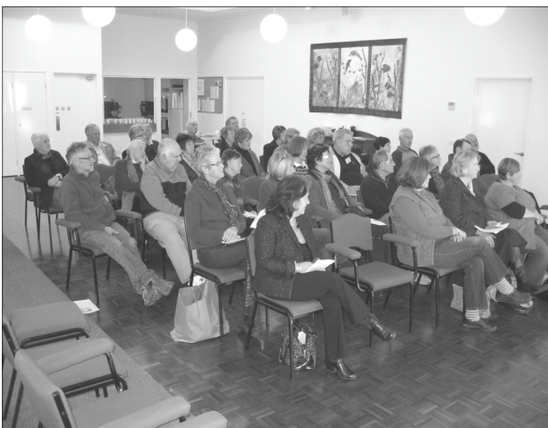
AGM at Lions's Village