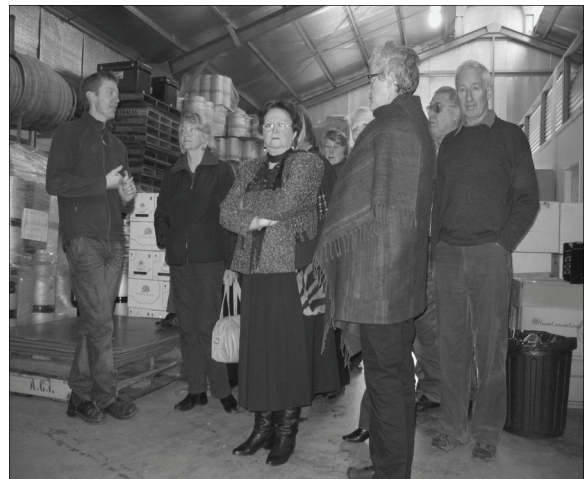
The Olway Estate Winery & Brewery

In the dim and distant past When life's tempo wasn't so fast Grandma used to rock and knit Crocket, tat and baby sit